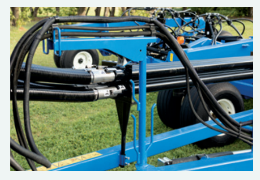
Electric and hydraulic hose holder